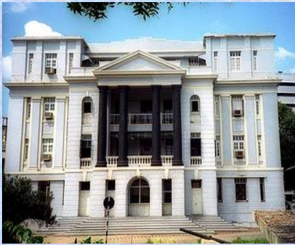
Fort St. George