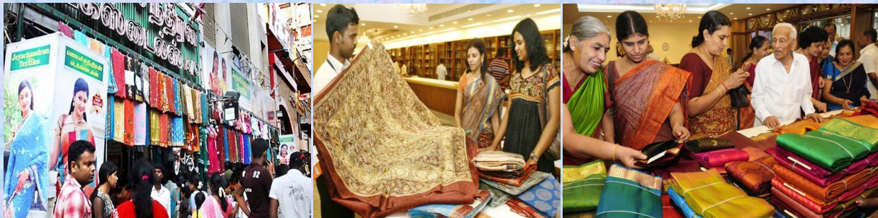
Chennai shopping places

Morning after breakfast, then you are free for shopping or enjoy in Chennai Largest beach ion Marin drive or own activists. Lunch & Dinner at local restaurant. After dinner you will be transfer to airport for registration and depart from Chennai airport flight MH181 by Malaysia airlines at 00.00AM for onward journey. End of tour.