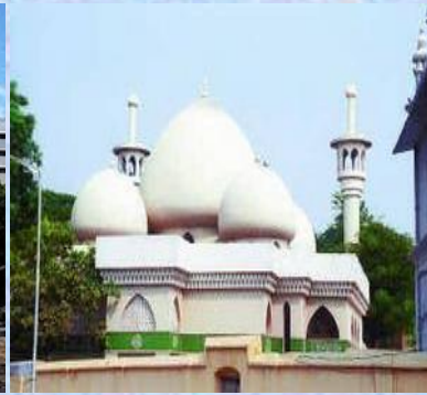
Thousand Lights Mosque