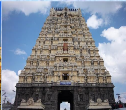
Vaikuntha Perumal temple